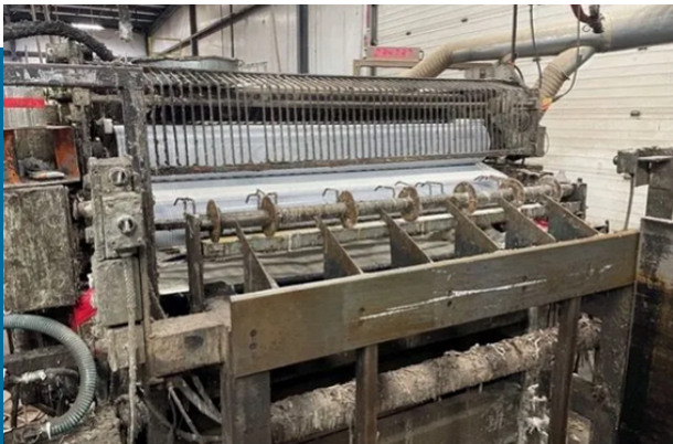
Before Dry Ice Cleaning